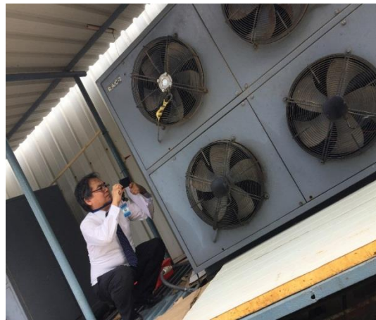
Visit to Universal Cold Storage