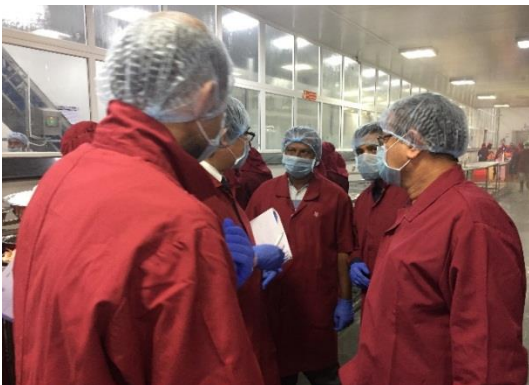
Visit to Kadar Exports plant